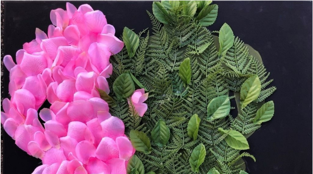
Untitled , by Aves (He/It) from Inside Out Youth Services

The core boundaries, liberating practices and anti-oppressive recommendations that have emerged from Trailhead’s work with Consulting Within Your Context, Talia Cardin and the Youth Sexual Health Program Board lay the groundwork for establishing a new approach to implementing youth sexual health education in Colorado. For systemic change to be effective, it is imperative to first identify and understand the core boundaries held by the Board as the foundation from which all engagement, action, and envisioning within the youth sexual health field must embody to be not only anti-oppressive, but liberating.